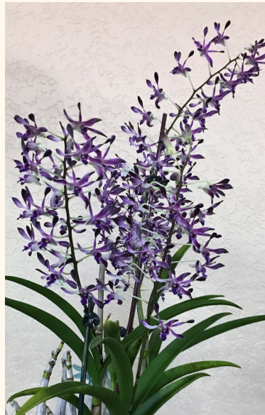
Den Blue twinkle Maija Nemati