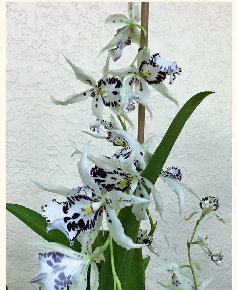
Billra. Snowblind 'Sweet Spots' MaryAnn Sisto