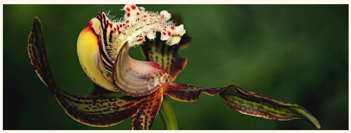
April & May 2020