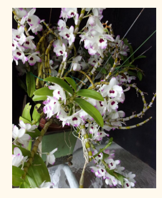
This had many cultures from both clubs. This is a vanda nobile, a very rewarding orchid, very long lasting