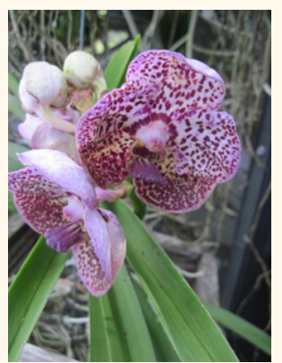
Another rewarding orchid. his was given to me by my granddaughter originally in a brandy snifter from Publix, no name Blooms faithfully every few months. Beautiful, and long lasting